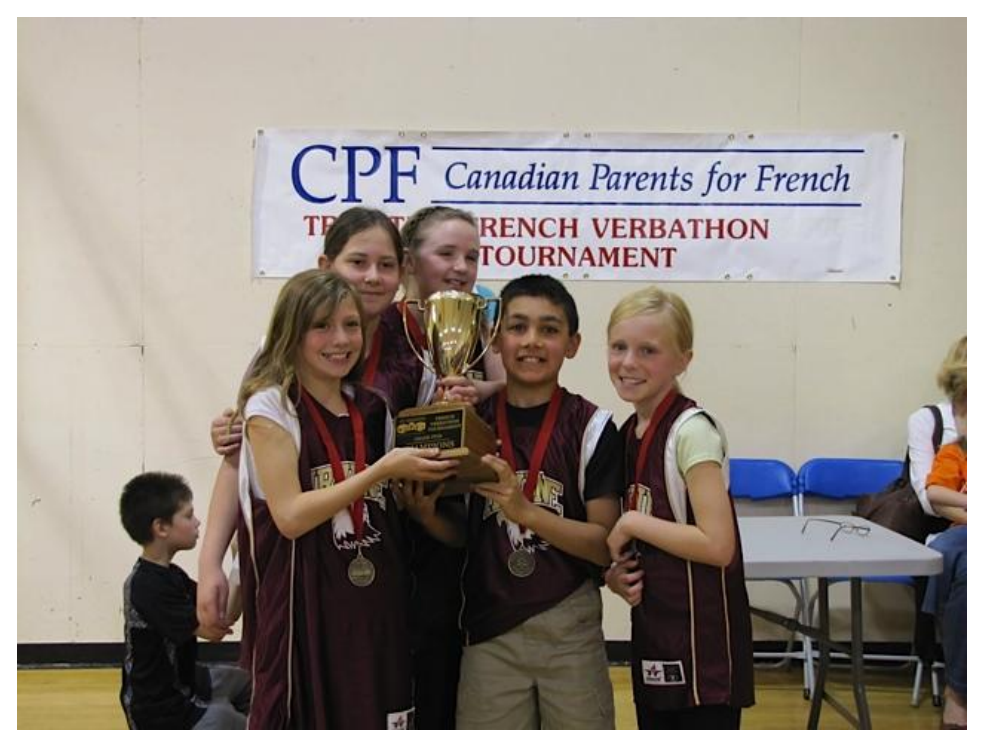
Grade 5 winners - Irvine - 01.18.94 min