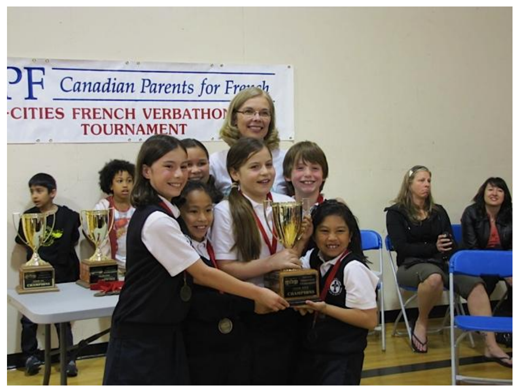
Grade 4 winners - Our Lady of Fatima - 01.30.00 min