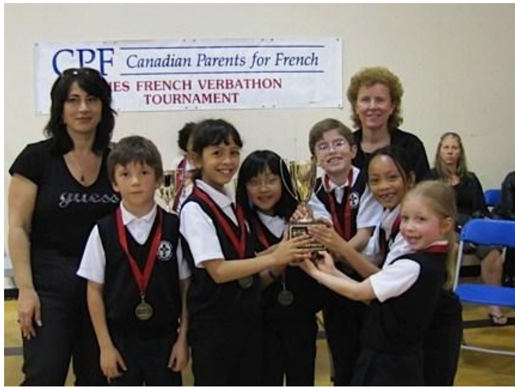
Grade 2 winners: Our Lady of Fatima - 00.53.18 min