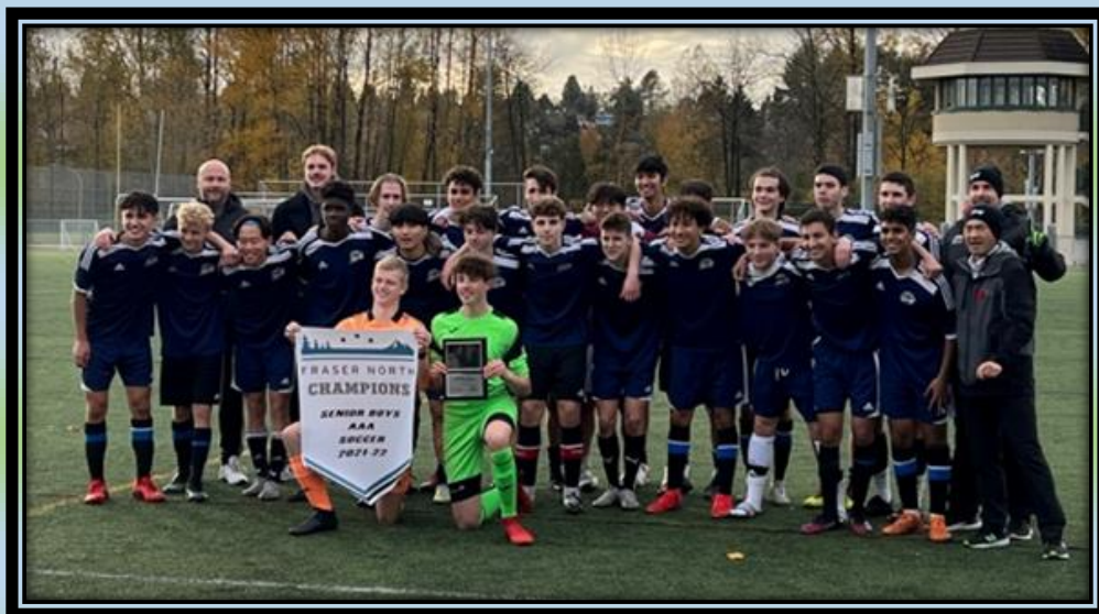
AAA Sr. Boys Soccer team 2021 Fraser North Champions

Our sports information can be found on our website under Athletics. Take a peek! http://www.sd43.bc.ca/school/riverside/ProgramsServices/Sports/Pages/default.aspx#/=