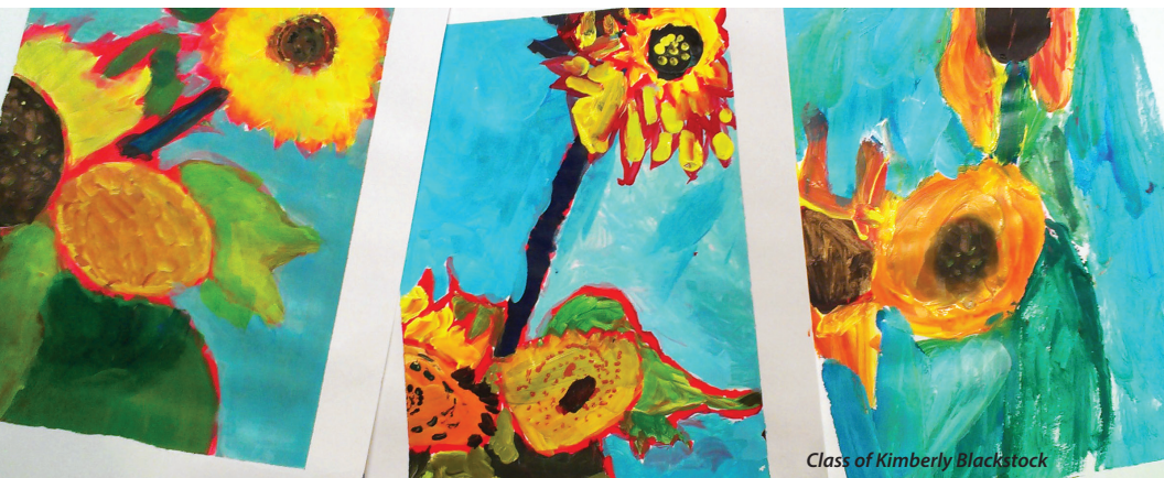
Class of Kimberly Blackstock

Spend a full day in the clay studio creating pottery and sculpture projects. After a supervised lunch break, children build a 'clay-land' together. All supplies included. For additional details see online registration.