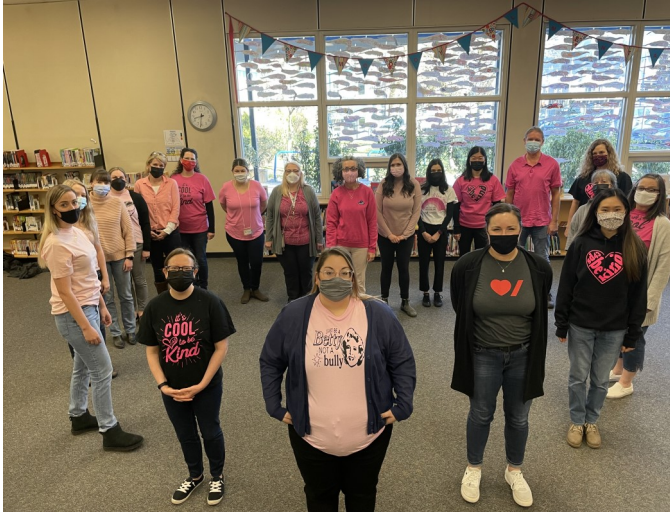
Moody Elementary Staff modeling big hearts and many shades of pink!