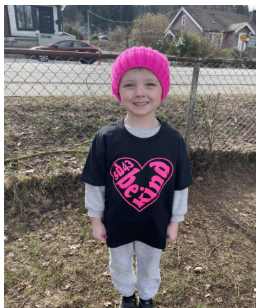
Many students wore "Be Kind" shirts & other pink gear!