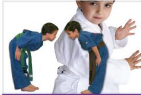
Martial Arts For Kids Age 3+