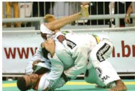
Brazilian Jiu-jitsu Programs for Kids, Teens, and Adults