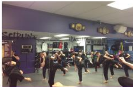
Martial Arts for Men, Women, and Teens