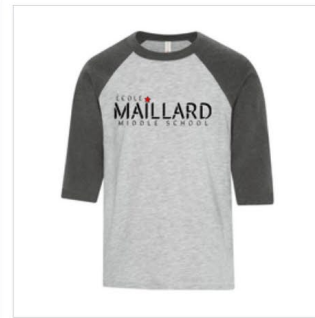
Atc Youth ES Active Baseball Youth Tee