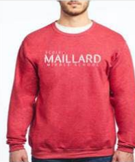
Unisex Crewneck Fleece