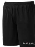
Atc™ Pro Team Shorts