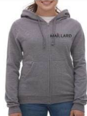
Unisex Zipper Fleece Hoodie