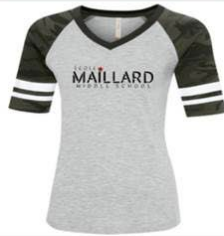
ATC™ Ladies Eurospun Ring Spun Baseball Tee