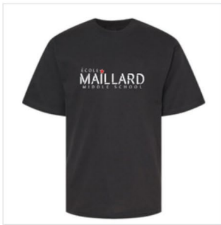
Youth Gold Soft Touch T-Shirt