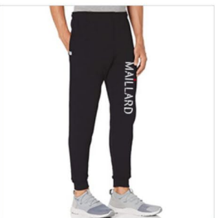
YOUTH DRI-POWER® FLEECE JOGGERS