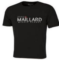
Atc™ EuroSpun Tee