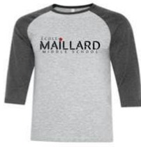
Atc™ ES Active Baseball Tee