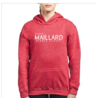
Youth Fleece Pullover Hoodie