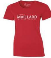
Atc™ EuroSpun Ladies' Tee