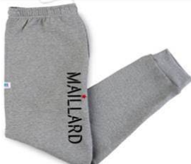
Russell Athletic Fleece Jogger