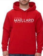
Unisex Pullover Hoodie