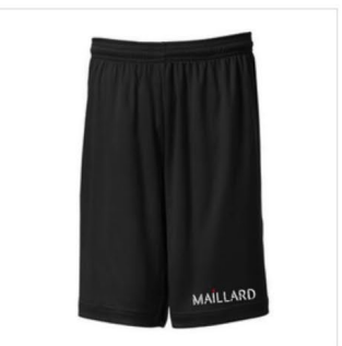
Atc™ Pro Team Youth Shorts