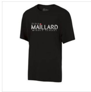
Atc™ EuroSpun Youth Tee