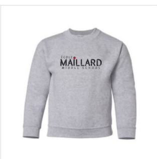
Gildan Heavy Blend™ Youth Sweatshirt