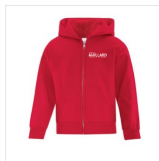
ATC Youth Everyday Fleece Full Zip Hooded Sweatshirt