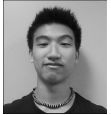
Grade 12 "Sexy car wash"