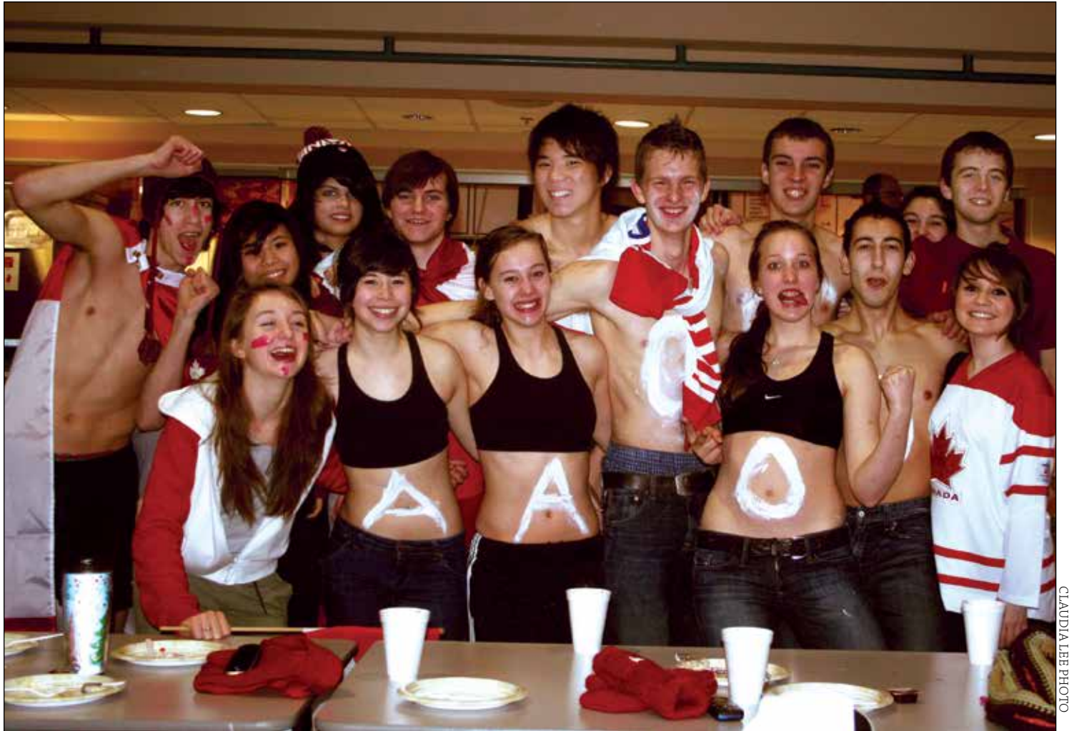
Showing their true colours: Gleneagle students celebrate Red and White Day with Canadian colours, body paint and a pancake breakfast. Over half the student body was dressed in Canadian attire on February 11.

"I was pleased that so many kids came. Oh