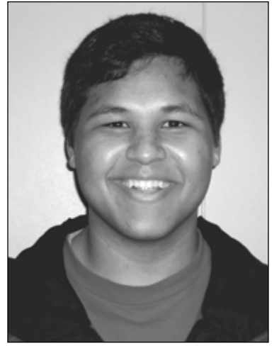
Grade 12 "Hockey - it's a contact sport."