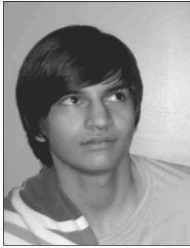
Grade 10 "Bobsled - it makes me jealous how fast they can go."