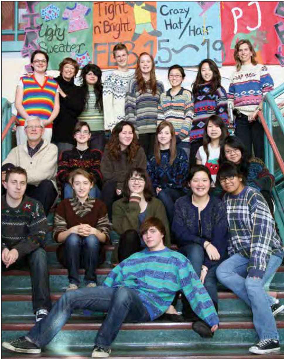
Robbing grandma's closet: Students and staff showed the iconic colours of yesteryear on Ugly Sweater Day, to kick off Spirit Week in style.