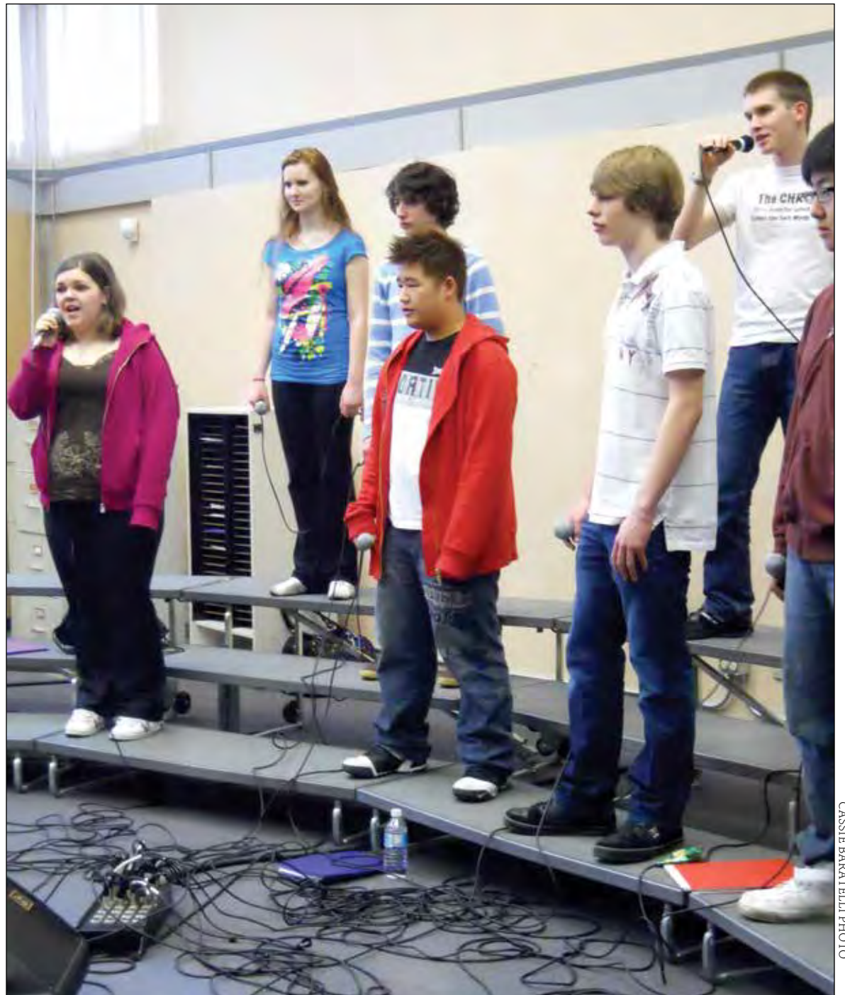
Jazz it up! Members of the Gleneagle vocal jazz choir warm their voices up for tomorrow's jazz dinner dance. They leave for competition in the United States on February 24.

Tickets are almost sold out for the Dinner Dance although there may be a few left at $30 a ticket. And in not too long the students will be on their way to Idaho.