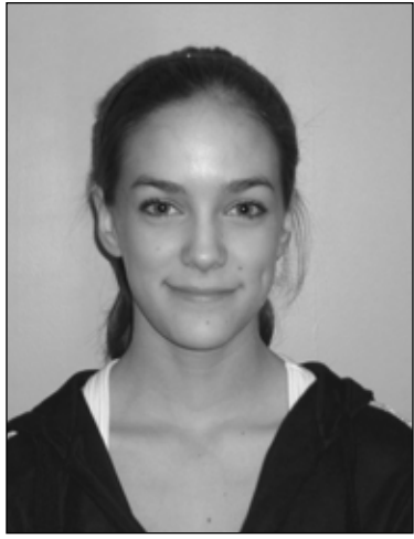
Grade 9 "Speedskating, because the speeds they can reach are amazing."