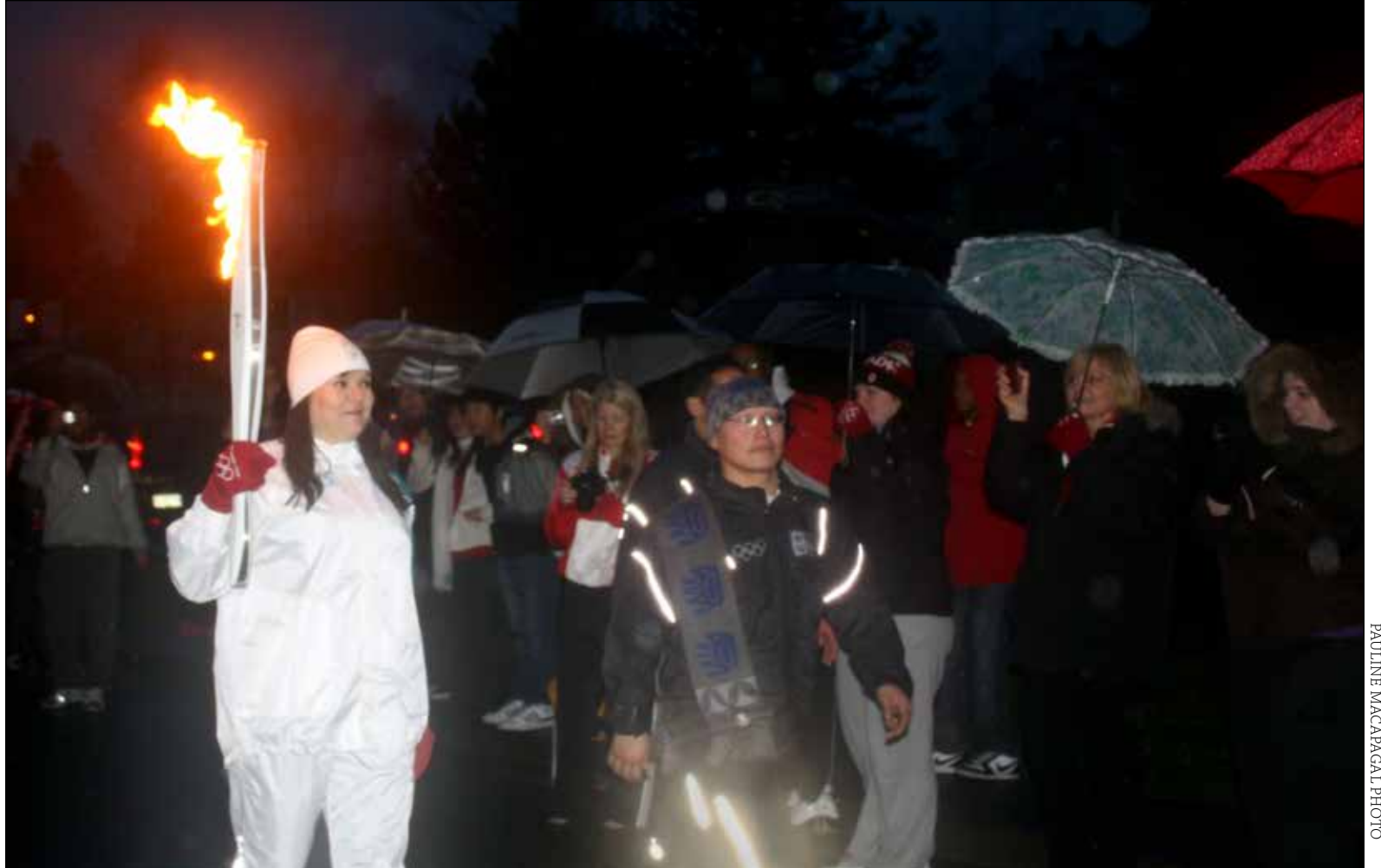
Taking pride in the moment: Hundreds of Gleneagle students and staff came together with community to welcome the torch to Coquitlam in the early hours of February 11, braving the wet weather.

"For me to have an opportunity to see the Olympic flame up