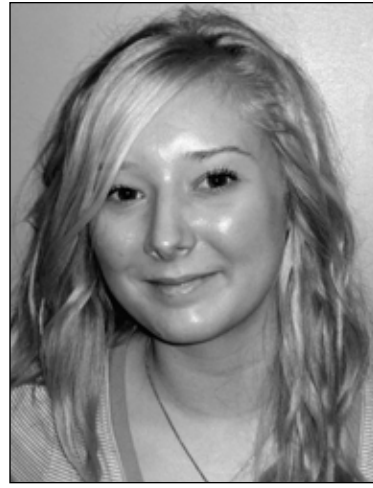
Grade 11 "Figure skating, because when I was younger I used to do it, so I can relate to the athletes."