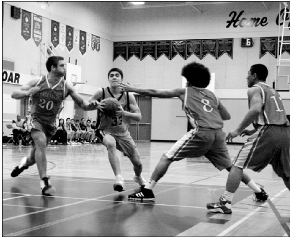
Through the traffic: Grade 12, braves enemy waters against Centennial in one of the senior boys final regular season games.

However, if the boys want to keep playing successfully, they "need to come ready to play and give a solid effort," grade 10, Ste-