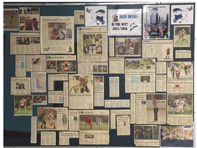
Blue Devils in the News Bulletin Board from 2015/16