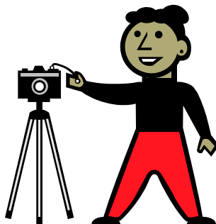
Photo retake day is on November 3rd at 9:00 a.m. for students who missed having their photo taken. Or if wish to replace the photos you received, you will need to return the proof package that contains the barcode (send with your child on retake day to hand to the photographer).