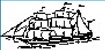
Learning the Voyage of Discovery