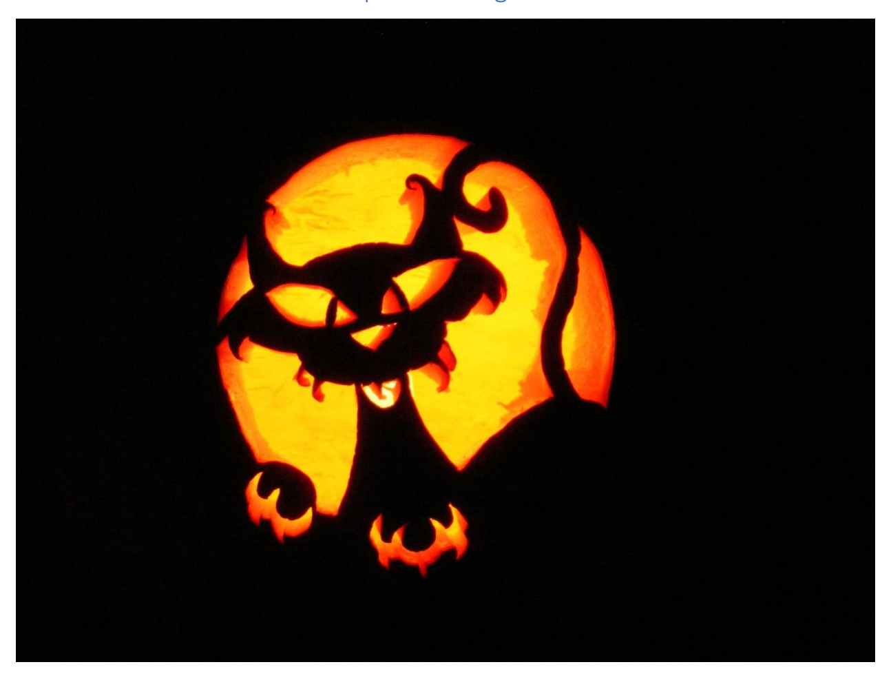
Baker Drive's 4th Annual Pumpkin Carving Contest and Costume Parade!

On Tuesday, October 31st, there will be a number of Halloween events that will take place in the morning and we would appreciate the support of our parent community!