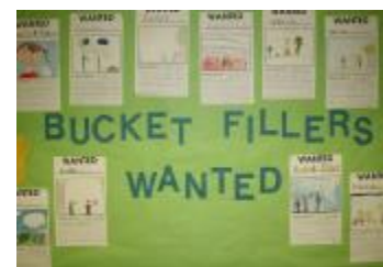
Our Code of Conduct sets a positive tone at Heritage Mountain Elementary.

and will apply increasing consequences for unacceptable conduct as students move through the Kindergarten to Grade Five continuum.