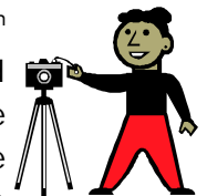
Photo retake day is on November 4 th @ 1:00 p.m. If your child missed Photo Day or you would like to replace the photos you received, please have your child come and get a retake done. Please avoid wearing Green or Teal. There is a permission slip attached at the end of this newsletter for you to fill in and return to the photographer on Retake Day. The photographers will have a list of those who indicated on their original orders who would like a retake, however the permission slip makes the process easier, particularly for the younger students.