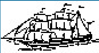
Learning the Voyage of Discovery