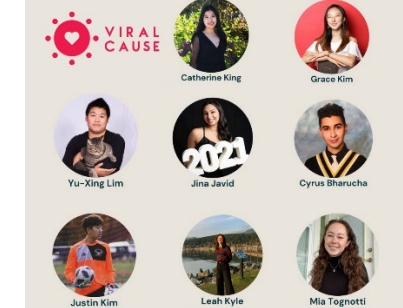
MEET THE NEW ORGANIZING TEAM Support their fundraising activities to help provide meals to struggling families through the Backpack Buddies Program!